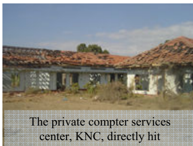
The private computer services center, KNC, directly hit