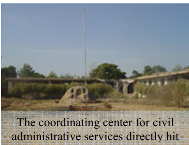
The coordinating center for civil administrative services directly hit