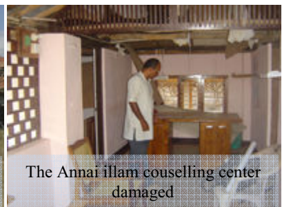
The Annai illam counselling center damaged

The targeted bombing of the infrastructure buildings in Kilinochchi was extensive during the first week of October. The pictures above are three samples of the damages to infrastructure. Other infrastructures directly hit by aerial bombing are the Tamileelam police head quarters, the political head quarters of the LTTE, and a store of TRO behind one of its shop. Other infrastructure buildings damaged by bombing are the branch office of the Center for Women's Development and Rehabilitation (CWDR), Vetrیمانai Home for the mentally ill women run