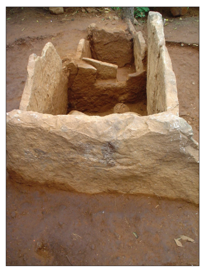
Figure 3: Simple cist with Passage, Thandikudi, Tamil Nadu.