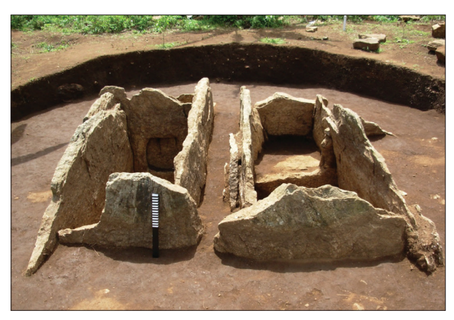
Figure 5: Cist with Double chambers, Thandikudi, Tamil Nadu.

The leveling of the ground for the banana and orange plantations led to the accidental discovery of the pear-shaped Urns, which is around 1m to 1.25m in height ( Fig. 6 ) and were invariably covered with sand and gravel. These urns are ill-fired, very coarse grained and wheel turned.