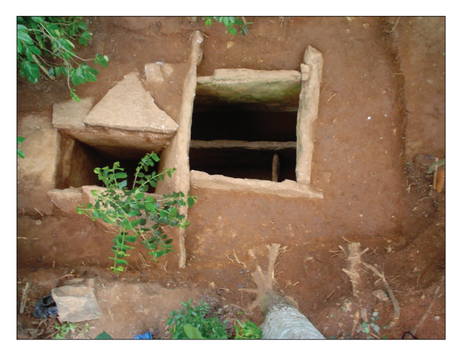
Figure 4: Cist with Multiple transepts, Thandikudi, Tamil Nadu.

After removal of the earth around the capstone, a perfect cist and a passage on the east were exposed. The cist is divided lengthwise by transept slab resulting in a northern and southern chamber. The northern chamber is further sub-divided into one more chamber by a slab on the west. The southern chamber would have been divided into one or two chambers, but as the slab was subsequently disturbed this could not be verified. Totally, 3 chambers and 3 circular portholes were noted and based