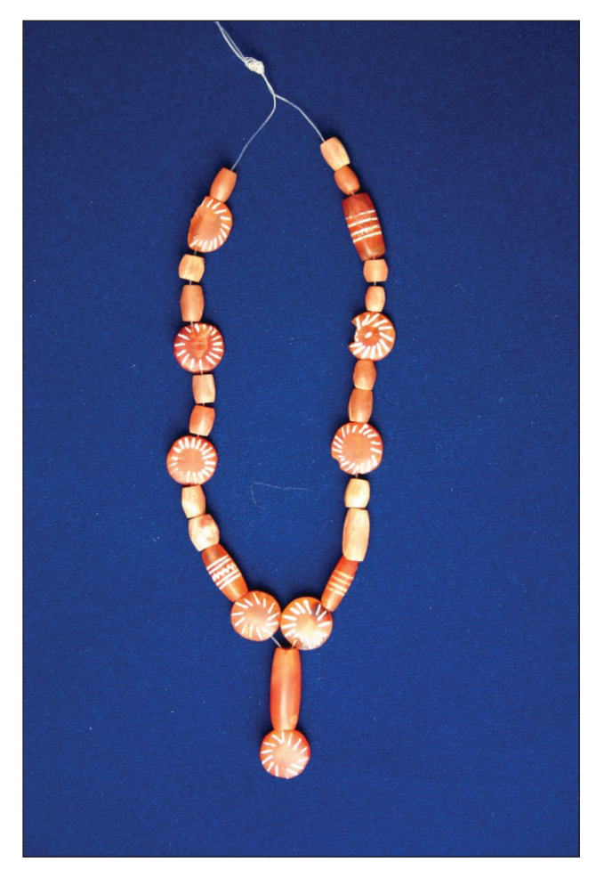
Figure 8: Beads, Thandikudi, Tamil Nadu.

from inner side and packed cairn stones for the outer sides for dolmens and rarely buttress wall was raised in the case of cists. Although the capstones bear only the crude hammer dressing, the finished orthostats and stones in the enclosure wall clearly indicates their mastery over the stone technique and iron. This is further attested by the found of chisel in one of the dolmens and other iron implements in the cists. Apart from the ceramics, hundreds of beads and pendants of carnelian (both plain and etched), quartz, steatite, soapstone, agate ( Fig. 8 ) were also discovered. Most of the shapes and sizes were akin to the Harappan beads (Kumaran et.al 2009: 279–289).