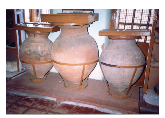
Figure 6: Urns from Senbaganur Museum, Tamil Nadu.

No grave goods were recovered, but some sherds of red ware, black-and-red ware and black ware were collected.