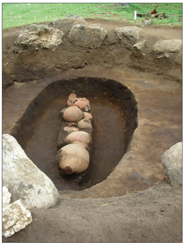
Figure 7: Carin circle, Thandikudi, Tamil Nadu.

The orthostats were placed around the floor-slab and they stand erect due to the thrust of the other slabs