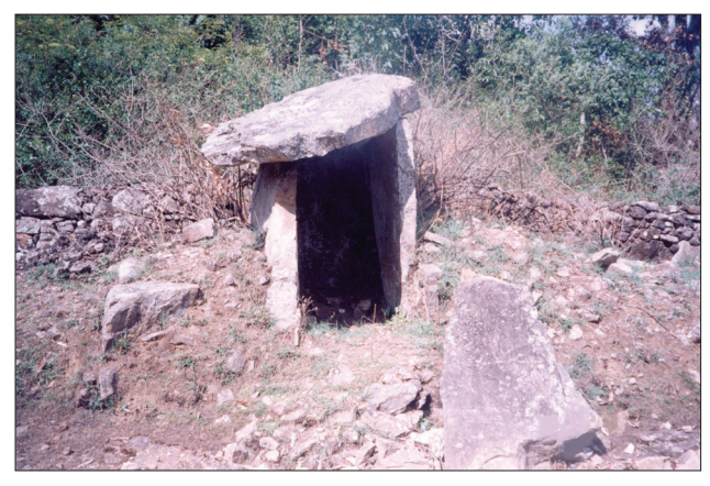
Figure 2: General view of Dolmen, Thandikudi, Tamil Nadu.