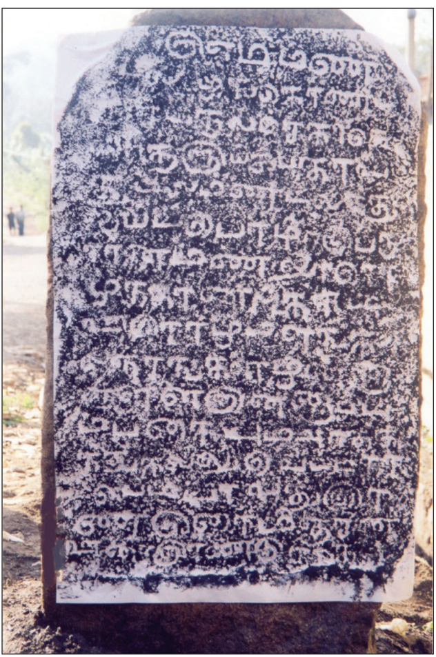
Figure 9: Trade guild Inscription, Thandikudi, Tamil Nadu.

At last the archaeological materials unearthed at Thandikudi clearly indicate that this village was continuously occupied since Pre-Iron Age times till date which was attested by the Medieval trade guild inscriptions ( Fig. 9 ) and late Medieval inscribed and un-scribed