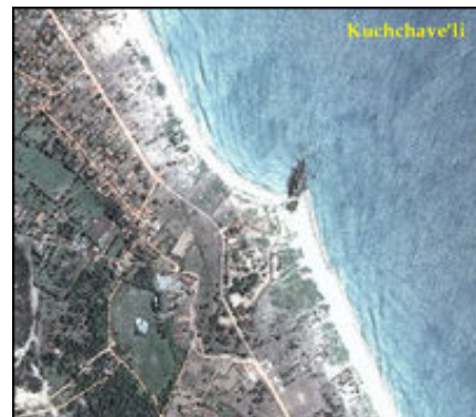
Landscape of Kuchchave'li. A Sanskrit inscription of 4th century CE is found in the rocks seen at the coast. [Satellite Image courtesy: Google Earth. Legend by TamilNet]