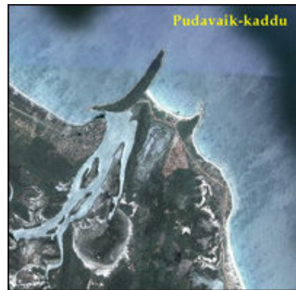
Landscape of Pudavaik-kaddu [Legend by TamilNet]