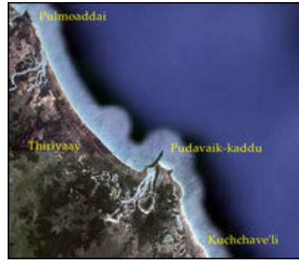
Location of Pulmoaddai, Thiriyaay, Pudavaik-kaddu and Kuchchave'li [Satellite Image courtesy: Google Earth. Legend by TamilNet]

courtesy: Google Earth. Legend by TamilNet]