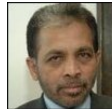
Dr. Palitha Kohona

"The man, Palitha Kohona, was the international face of the Sri Lankan government's war with separatist militants, the Tamil Tigers, and played an important role in the surrender of Tamil Tiger soldiers following their defeat in May 2009," the paper said.