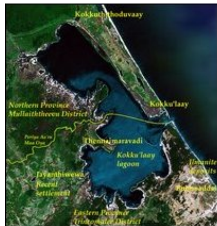
The location of Kokku'laay village and lagoon.