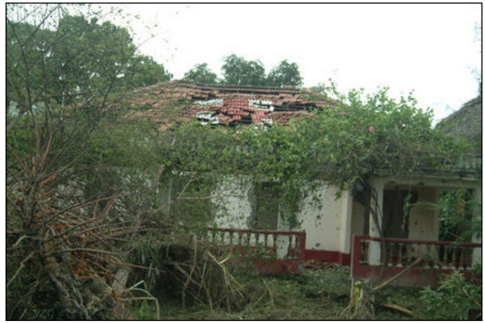
SLAF bombardment on Holy Cross Convent in Paranthan