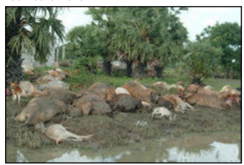
Cows killed in SLAF cluster bombardment on cattle herd in Paranthan