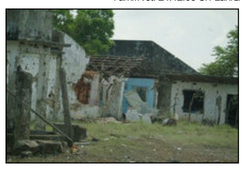
Co-operative society building bombed in Paranthan