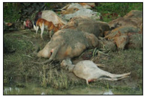
Livestock killed in SLAF cluster bombardment