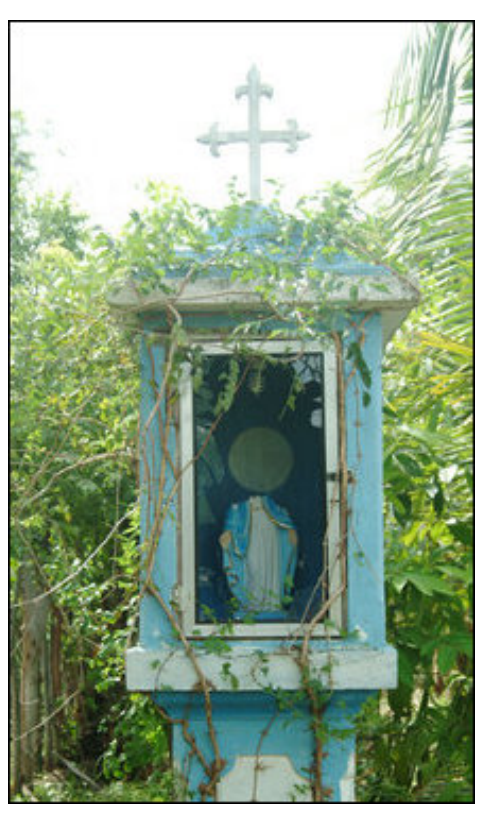
SLAF bombardment on Holy Cross Convent in Paranthan