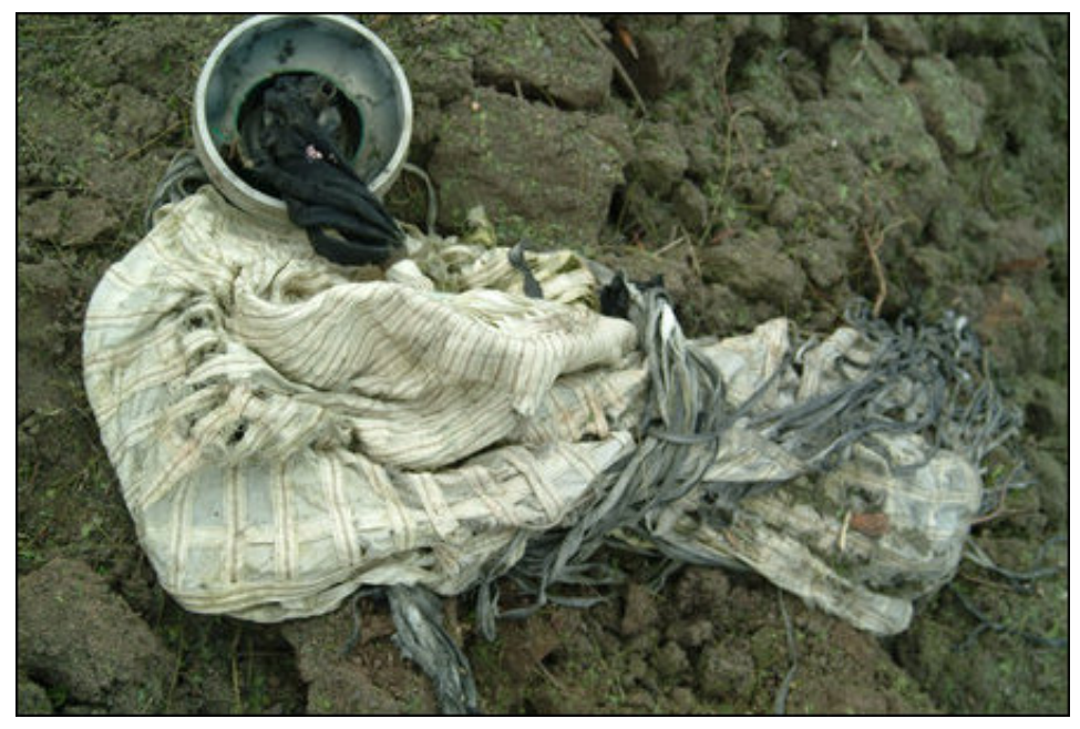
The trace of cluster bombing. A parachute used to drop cluster container and the remains of the exploded case which carried bomblets.

Sri Lanka Air Force (SLAF) bombed a convent named Holy Cross Convent, located on Paranthan Mullaiththevu Road, 600 meters away from Paranthan junction Tuesday night around 10:30 p.m., a day before Christmas. TamilNet correspondent who visited the site Wednesday morning witnessed that the attacked premises was marked with Red Cross on the roof. The nearby church also sustained damage. The SLAF deployed cluster munitions in the bombardment, residents who fled the site said. 85 cows of a herd a few meters away from the convent were killed in the attack.