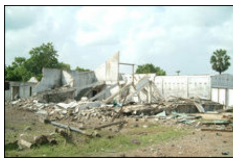
Co-operative society building bombed in Paranthan