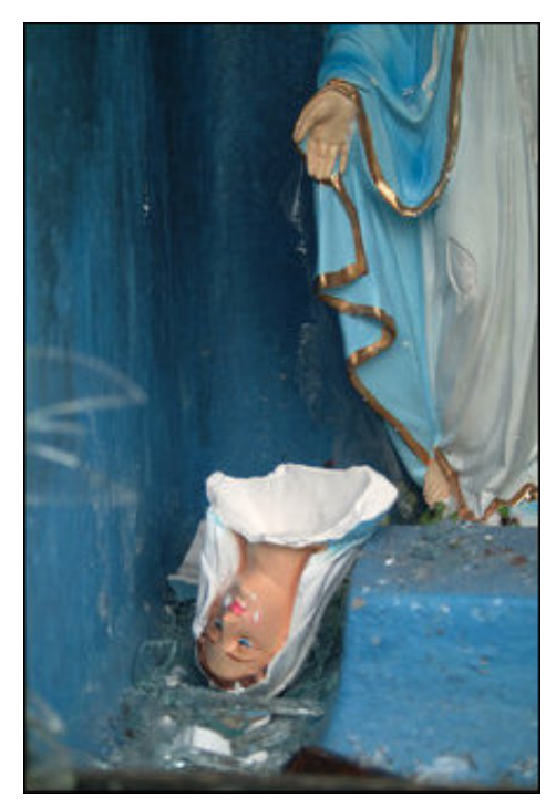
SLAF bombardment on Holy Cross Convent in Paranthan