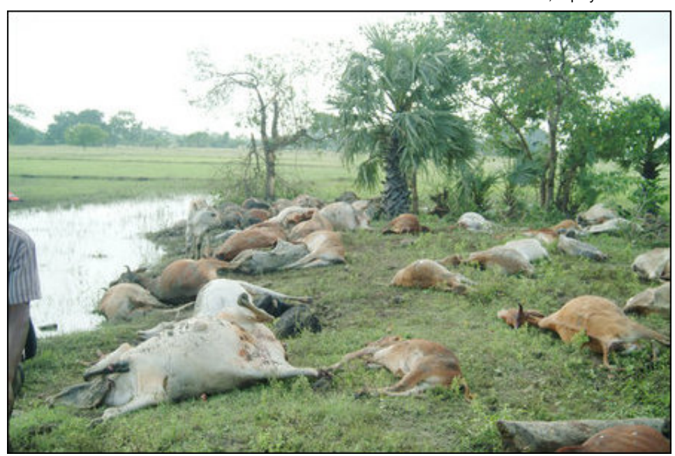
Livestock killed in SLAF cluster bombardment in Paranthan