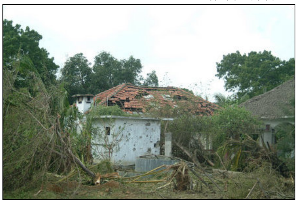
Red Cross marked roof of the Holy Cross Convent bombed by the {\sf SLAF}

SLAF bombardment on Holy Cross Convent in Paranthan