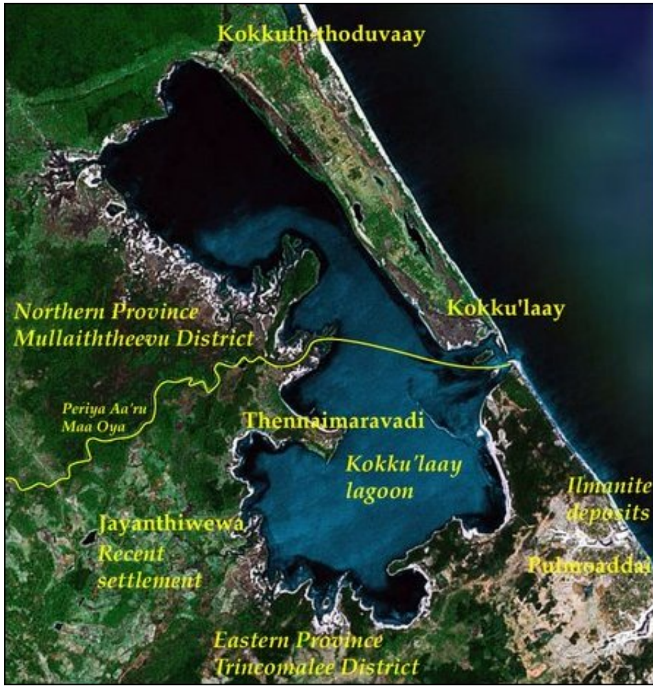
The location of Kokku'laay village and lagoon. [Satellite map courtesy: Google Earth]