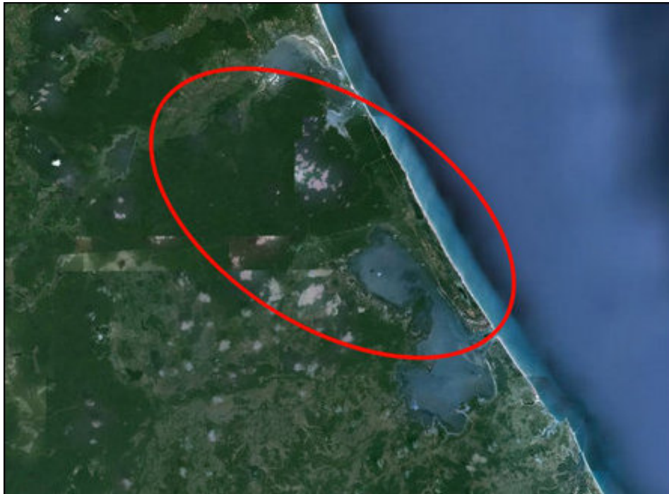
The location of the newly Sinhalicised division in the Mullaitheevu district that will be wedging North and East, created after erasing out traditional Tamil villages and renaming it from Ma'nalaa'ru in Tamil to Weli-Oya in Sinhala. [Satellite image courtesy: Google Earth. Legend by TamilNet]

The genocidal Sinhala State in Colombo has accelerated the process of creating a Sinhala division at Ma'nal-aa'ru renamed as Wæli-oya in Sinhala, in the strategic locality linking North and East territory of the Tamil nation in the island of Sri Lanka, by deploying Indian and other international aid, civil sources in Mullaitheevu said. The housing aid of India and the infrastructure aid of the IC are pooled in creating the Sinhala division, with all facilities of attraction for the Sinhalicisation process at the wedging locality. This is carried out not without the blessings of India, the USA, the UK, Canada and Australia whose delegates visited the region in the recent months, the civil sources commented, adding that what was heard from the Indian Foreign Minister in the parliament on Wednesday on implementing the 13th Amendment was a sour joke of quarter a century.