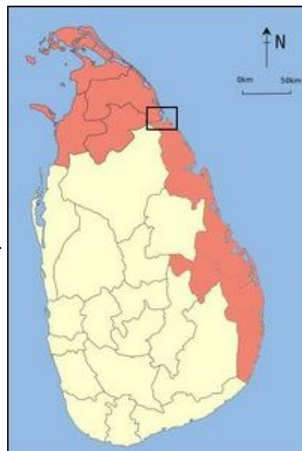
The region of traditional territory of the nation of Eezham Tamils 'officially' Sinhalicised by genocidal Colombo with and aim of wedging North and East.

Whenever the Tamil people having legal documents refuse to give up their land by mere 'brain washing' then they are intimidated by the occupying Sinhala military and the SL government machinery. Such people's activities are systematically paralyzed. They are terrorized and silenced.