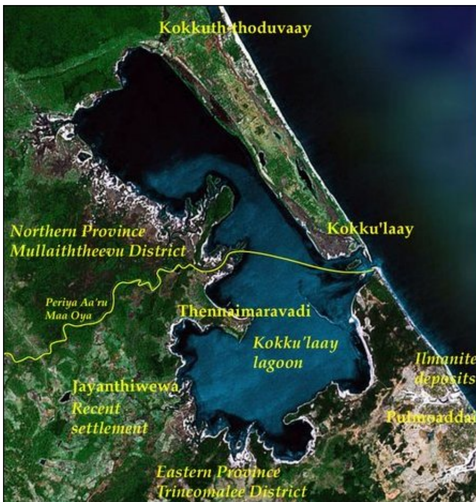
The location of Kokku'laay village and lagoon.

The original people of Ma'nal-aa'ru that was exclusively a part of the traditional Tamil homeland are in possession of documents, including title deeds, to confirm the ownership of their lands. They were continuously subjected to refugee-life for the past 30 years. But they never lost their aspiration to return to their villages of fertile agricultural lands.