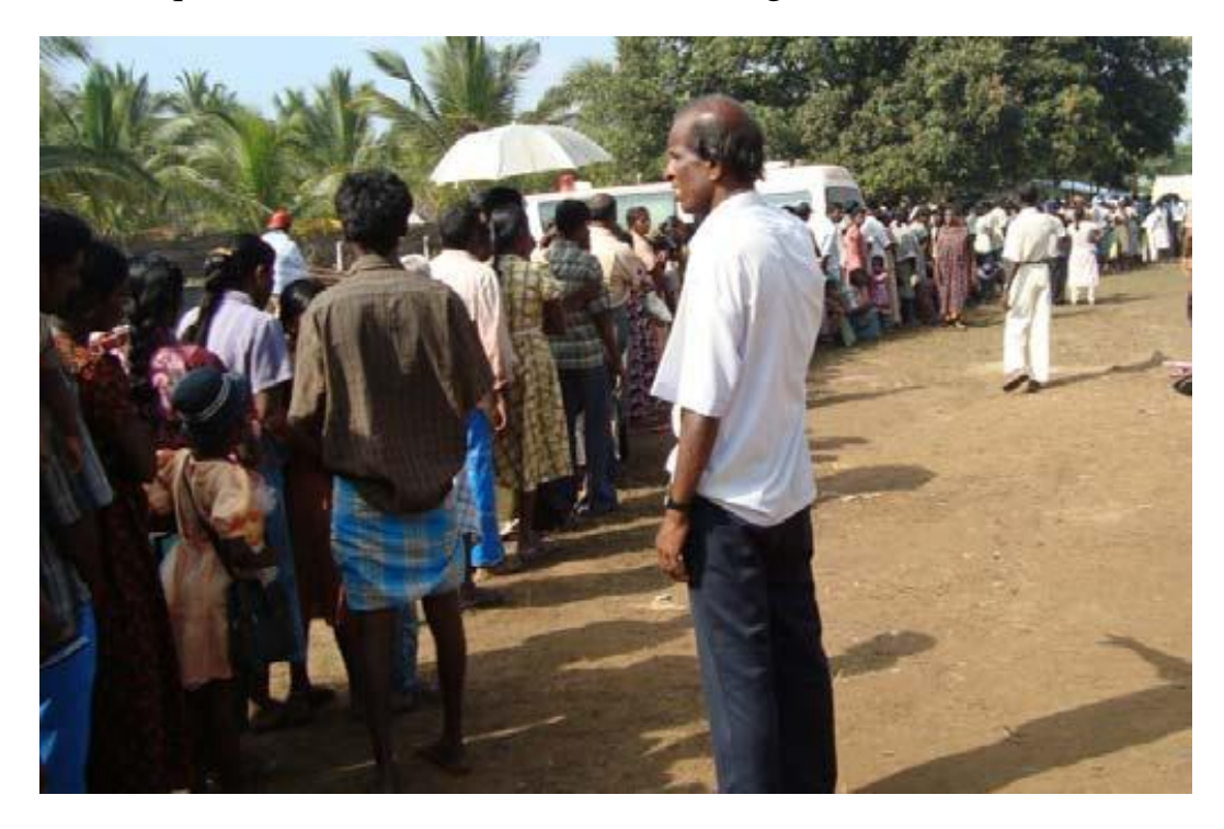
Report to Congress on Incidents During the Recent Conflict in Sri Lanka

2. Photo of a queue for medicine in the NFZ during the week of March 9.