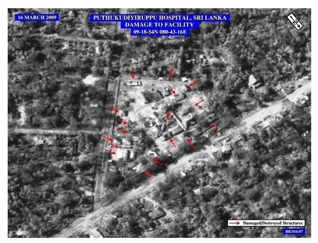
Report to Congress on Incidents During the Recent Conflict in Sri Lanka