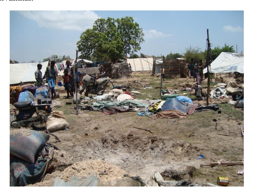
Report to Congress on Incidents During the Recent Conflict in Sri Lanka

4. Photo of shell crater taken on May 1 following the April 30 shelling of Mullivaikkal.