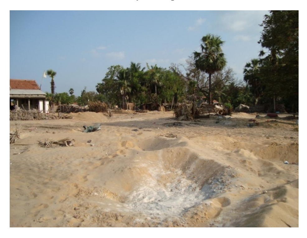
Report to Congress on Incidents During the Recent Conflict in Sri Lanka

6. Photo taken on May 3 following a multi-barrel shell attack on civilians living in an area between Mullivaikkal Pillayar temple and the sea.