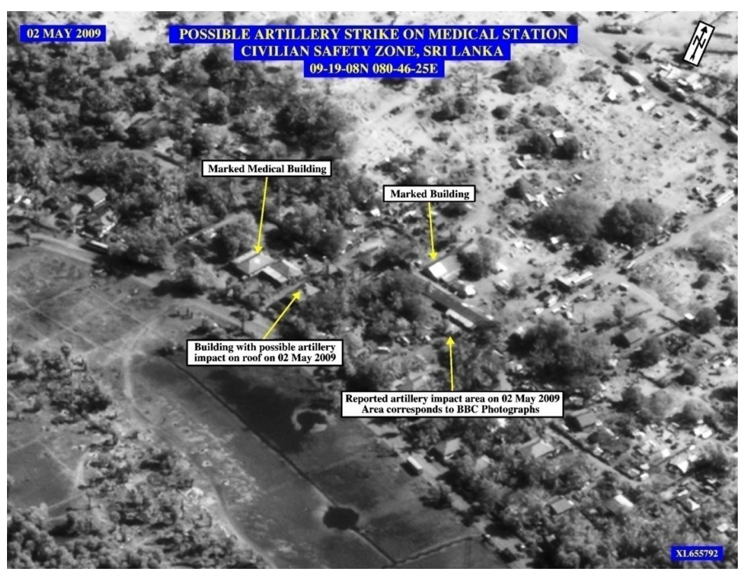
Report to Congress on Incidents During the Recent Conflict in Sri Lanka