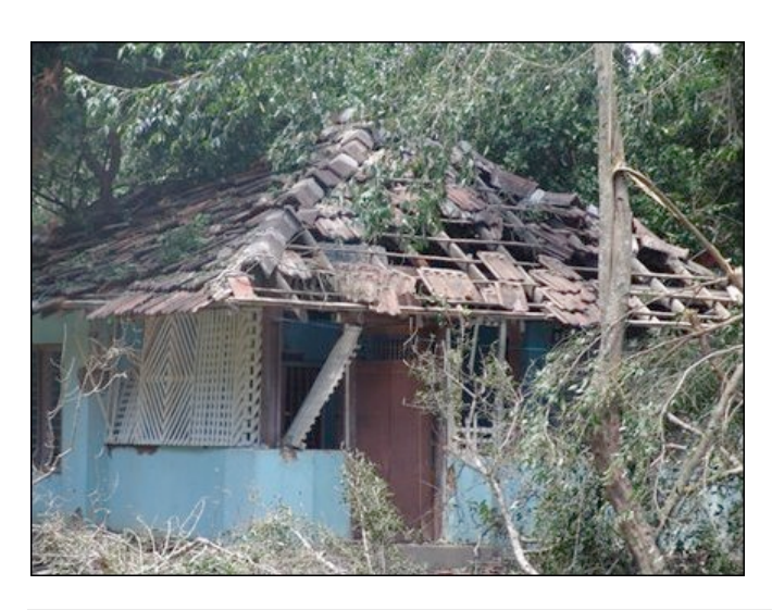
A building of Sencholai, destroyed in SLAF bombing Sencholai attack "pre-meditated, deliberate and vicious"- TNA

TRO calls on the Human Rights Commission of Sri Lanka, International Human Rights agencies (Amnesty International, Human Rights Watch), the Government Agent, and Civil Society investigate this crime against humanity. The climate of impunity that exists in Sri Lanka contributes to the abuse of human rights and extrajudicial killings. The bombing of this orphanage, the execution of the 17 Action Contre la Faim Tamil staff, the abduction of the 7 TRO staff in January, and the continuing denial of humanitarian relief to war displaced in the Trincomalee District are just a few of the recent human rights abuses committed by the government or paramilitaries affiliated with the government.