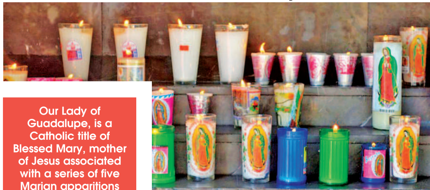
Candles lit by pilgrims

Our Lady of Guadalupe, is a Catholic title of Blessed Mary, mother of Jesus associated with a series of five Marian apparitions and a venerated image on a cloak enshrined within the Basilica of Our Lady of Guadalupe in Mexico City. The Basilica is the most-visited Catholic shrine in the world, and the world's third most-visited sacred site.