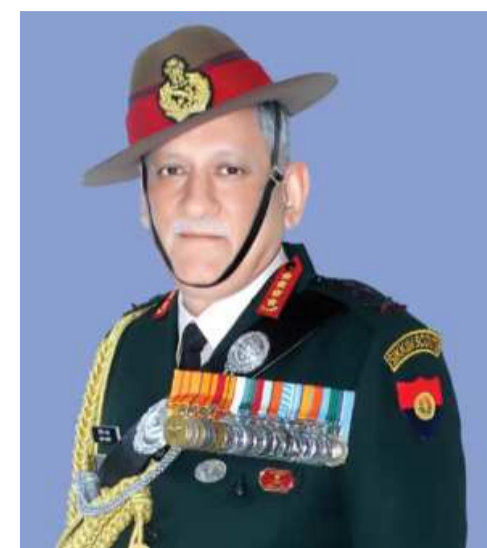
Chief of Defence Staff of Indian Armed Forces General Bipin Rawat.