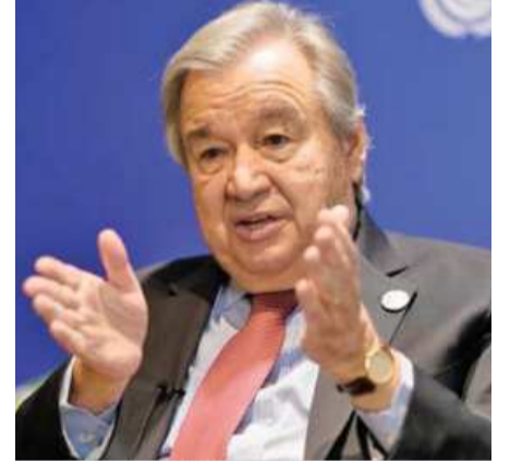
UN Secretary-General Antonio Guterres

UN: Climate Change is an aggravating factor for instability, conflict and terrorism, UN Secretary-General Antonio Guterres said Thursday.