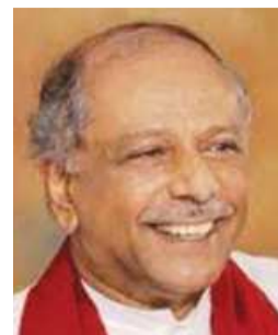
A motion moved by the Leader of the House Dinesh Gunawardena to extend the term of office of the Parliamentary Select Committee (PSC) on Electoral Law Reforms was approved by Parliament yesterday (10). The House was also

informed that the report of the Select Committee is being prepared at present. The term of office of this Committee was scheduled to end on January 16 next year. This Parliamentary Select Committee was appointed by the Speaker on a resolution passed in Parliament on April 5, 2021. Chairman of the Committee Minister Dinesh Gunawardena stated that representatives of political parties, the Election Commission, the Delimitation Commission, the Attorney General's Department, election monitoring organisations, other relevant agencies and organisations as relevant stakeholders, have been summoned before this Select Committee during the last few months seeking views and suggestions for the reform of electoral laws.