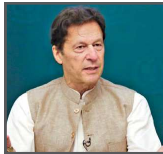
Pakistani Prime Minister Imran Khan

A few years ago, the country had witnessed the