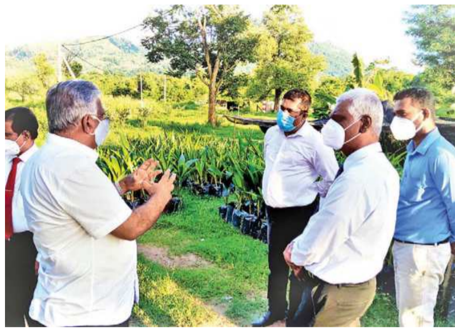
During the inspection tour.