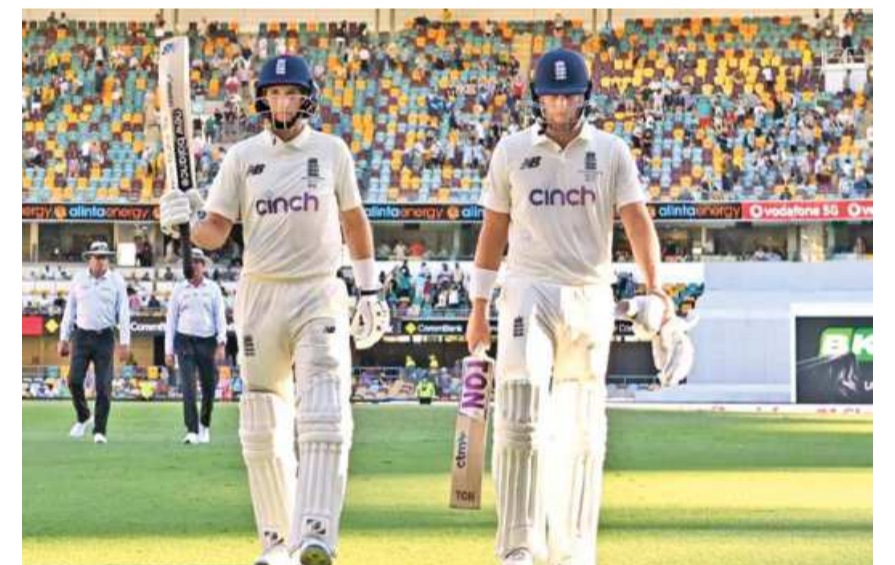
Dawid Malan and Joe Root put on an unbroken 159 for the third wicket.