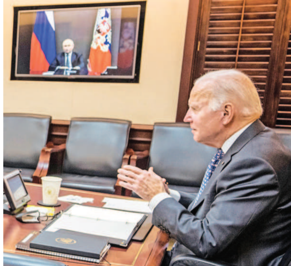
US President Joe Biden holds virtual talks with Russian leader Vladimir Putin from the Situation Room of the White House in Washington on Tuesday.

gium. It was one of the most crippling measures used against Iran, and would make Russia a pariah in international finance.