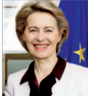
European Commission President Ursula von der Leyen