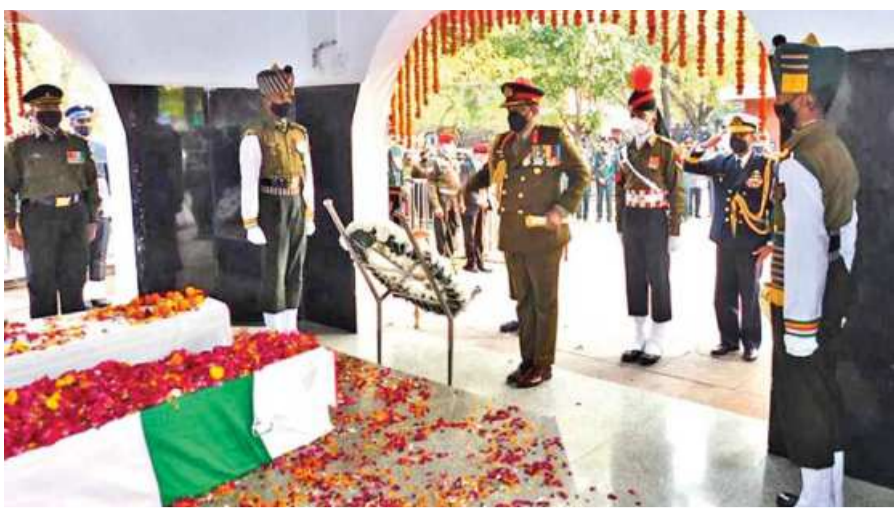
Army Commander and Chief of Defence Staff General Shavendra Silva yesterday paid his last respects to the Chief of Defence Staff of Indian Armed Forces General Bipin Rawat who died in a helicopter crash in Tamil Nadu on Wednesday.