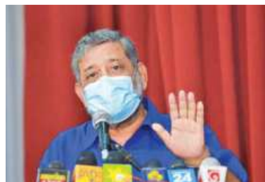
Former Minister Tissa Karaliyadda speaking at the meeting.

Former Minister Karaliyadda also said that those who came to power with the support of the SLFP seemed to have kicked the ladder preventing others from climbing to the top. "Those who now treat us scornfully and maliciously are on top positions of the Government thanks to the SLFP, which they have forgotten. The SLFP was highly instrumental in winning the election," the former Minister said. Former Minister Weerakumara Dissanayake said that the people were questioning whether the Government would break down