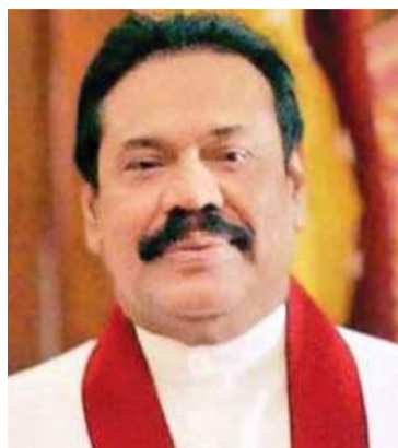
fullest contribution. The Prime Minister made these observations joining the Committee Stage Debate on the Budget proposals for Financial Year 2022 under the financial heads of Economic Poli-

The Government expects that the COVID-19 pandemic situation would be eliminated from the country enabling it to revive the economy properly, said Prime Minister Mahinda Rajapaksa in Parliament yesterday. He said that although the country too is facing difficulties due to this global pandemic situation, the Government has taken measures to control the situation effectively and the National Planning Department is making long term, medium term and short term plans to achieve gradual and sustainable economic revival in collaboration with all institutions.