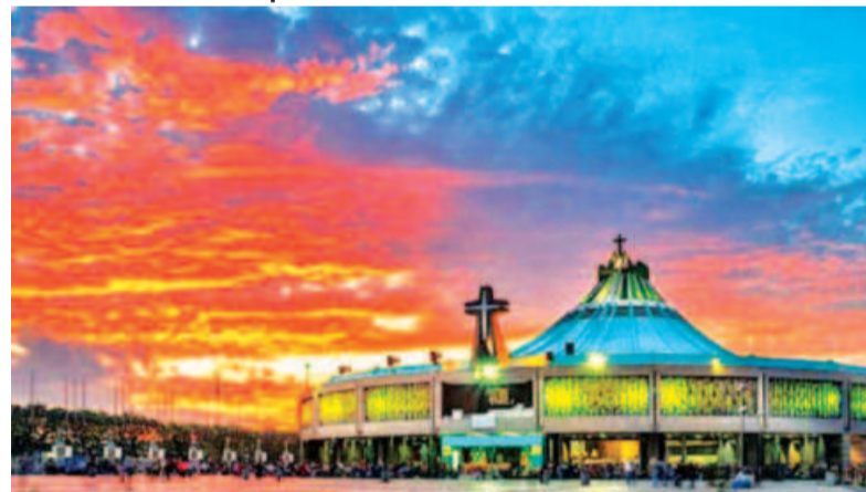
The new Basilica at sunset