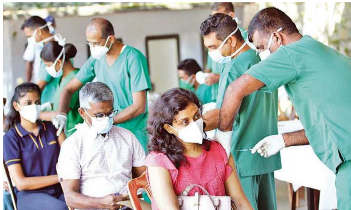
The Sri Lanka Army's Medical Corps began rolling out the Pfizer booster shots for those above 30 years and completed their second COVID vaccine three months back at the Viharamahadevi Park yesterday.