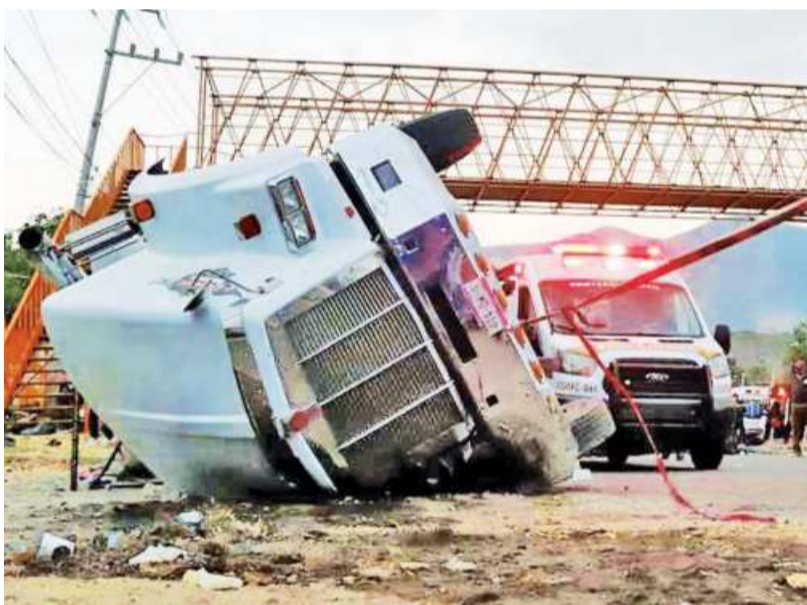
A truck that was transporting migrants is seen rolled over after a traffic accident that killed migrants from Central America in Tuxtla Gutierrez, Mexico on Thursday.