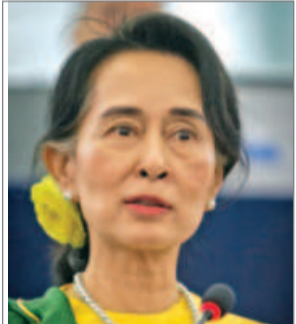
Aung San Suu Kyi