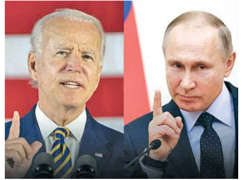
US President Joe Biden and Russian President Vladimir Putin at odds over Ukraine.

Ukraine says it fears an invasion by tens of thousands of Russian troops gathered near its borders,