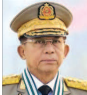
Myanmar's Junta Chief Min Aung Hlaing