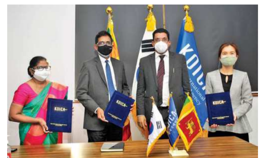
Justice Minister Ali Sabry, PC during the Project Signing Ceremony.

region with highly advance technologies in the forensic science. KOICA is also conducting capacity building programme (2020-2023) for the Department of Government Analyst for more advanced and practical analysis techniques. The Korean Government has furthered its grant aid by US$ 4 million towards strengthening capacity building of Forensic Drug Analysis in the Criminal Justice System in Sri Lanka. The KOICA Country Director said that KOICA has had a long-standing partnership with Sri Lankan Government. "We are always looking forward to supporting our partner countries to make sustainable Development. Through this Project, the Republic of Korea, expects to support Sri Lanka in strengthening the partnership and cooperation with Sri Lanka to combat against the narcotics related crimes," the Country Director said. Officials of Justice Ministry and the