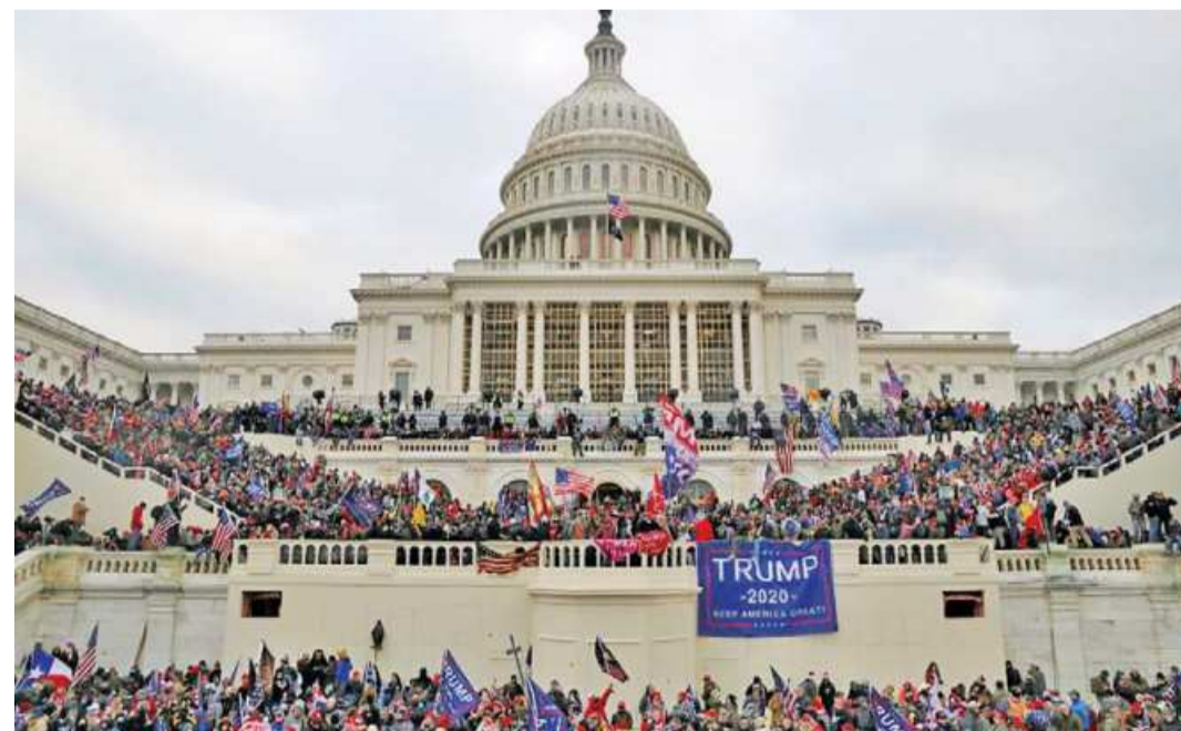
Supporters then US President Donald Trump gather at the west entrance of the Capitol during a 'Stop the Steal' protest outside of the Capitol building in Washington DC January 6, 2021.

US: A US federal appeals court on Thursday rejected former president Donald Trump's bid to prevent the release of White House records relating to the January 6 attack on the Capitol.