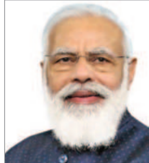
Indian Prime Minister Narendra Modi