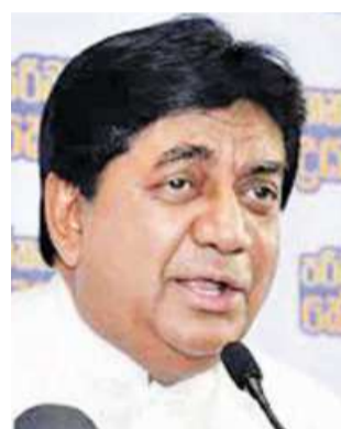
Temple Trees and formulated an illegal FCID and decided as to who should be brought before the Court. This is also a system change.