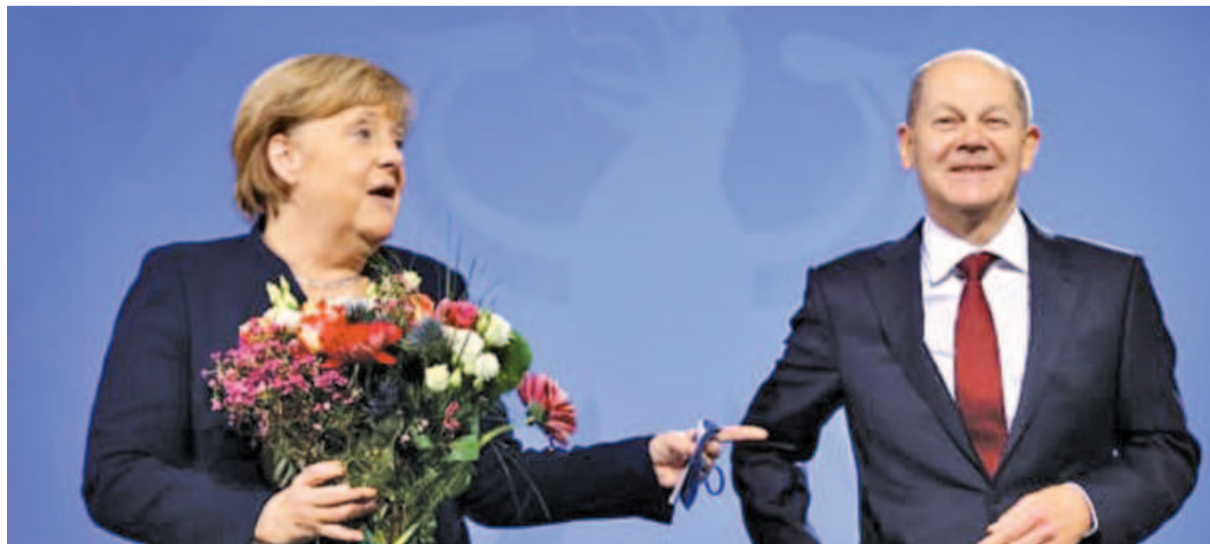
Former German Chancellor Angela Merkel holds flowers as she hands over the chancellery to her successor, newly appointed German Chancellor Olaf Scholz on December 8, 2021.

U.S. officials hope to win support during the meetings for global initiatives such as use of technology to enhance privacy or circumvent censorship and for countries to make specific public commitments to improve their democracies before an in-person summit planned for late 2022.