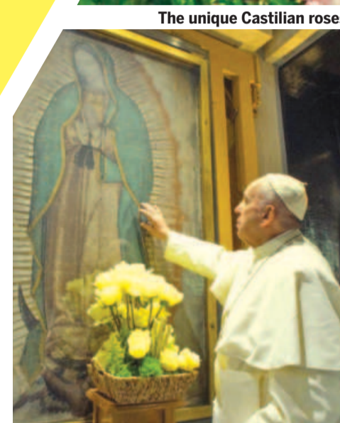
The unique Castilian roses

The New Basilica, as it is called, was built from 1974 till 1976 by Pedro Ramírez Vázquez. The building has seven entryways