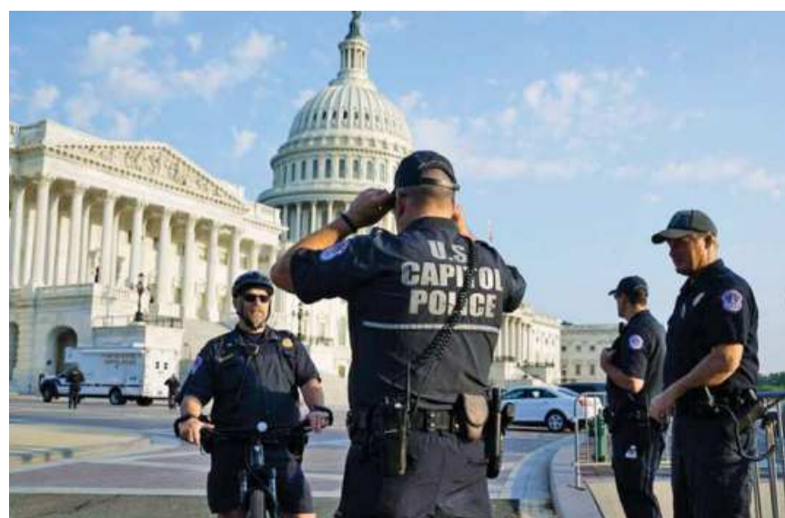
US Capitol Police on duty.