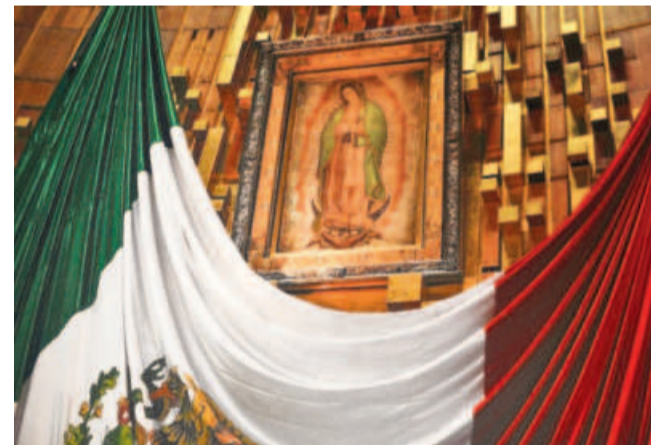
The Mexican flag inside the new Basilica