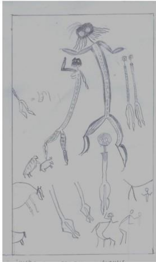
Fig. 3.4 : Masked Human figures and Animals – A painting from Badami