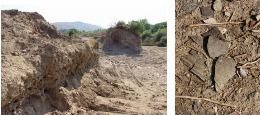
Fig. 3.2 : Ash Mounds of Bisnala (Bijapur District)