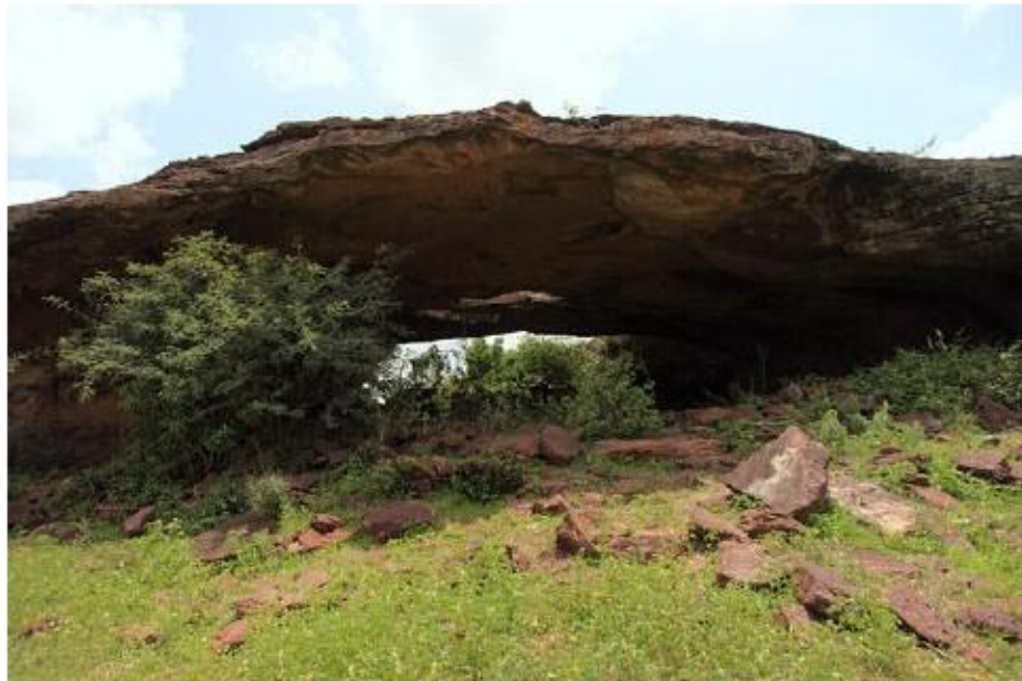
Fig. 3.1 : Shidalpahdi Rock Shelter at pre-historic site, Badami

During this period man wandered for the sake of food, picking up roots and fruits, and hunting animals. In addition to hunting animals he captured the animals, domesticated and trained them during this period. Because of very fine and tiny stone implements were being primarily used hence the period it is called as Mesolithic or Microlithic culture. Sharp stone blade pieces were placed side by side, one after another, fixing them with the help of the glue obtained from the vegetation. Fish hooks, Knives and sickles were also manufactured. The implements of this age saved multiple purposes. For digging the soil, harvesting, making fishnets etc, these implements were being used. At the end of the Pleistocene Age there were marked changes in the climatic conditions. With a rise in temperature, along with food gathering, it appears that, the men towards the end of the Microlithic culture achieved the cultivation of tuber crops, leafy vegetables and cereals on a small scale.