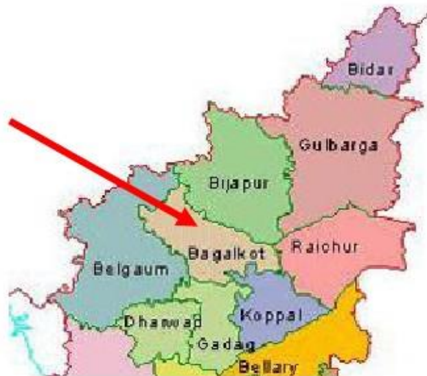
Fig. 3.5 : Northern Karnataka (arrow showing Bagalkot District)

We can trace the definite beginning of the History of Karnataka; from the period of Mauryas or precisely to the third century B.C. Maurayan Emperor “Devanama Priya Priyadarsi Ashoka” was ruling almost all over India including northern parts of Karnataka. Ten minor Rock Edicts and Four Major Rock Edits belonging to the period of Ashoka are reported from Chitadurga, Bellary, Raichur and Gulbarga Districts. These important edicts are found at Siddapur Brahmagiri, Jatingaramesvara, Maski, Koppal, Nittur, Udayegola, and Suvarnagiri. But Ashoka’s rock edicts have not been found in the Bagalkote district till now. It is recorded in the Singiraja purana, a work of 15 th century that the province of Pattadakal was within the control of the Nandas 29 . Even its fact that the Ashokan Edits found in neighbouring district of Bagalkote at Sannati, in Kalburgi district, Koppala and Maski in Raichur district, thus it may be presumed that Bagalkote district also had come under the administration of the Mauryas.