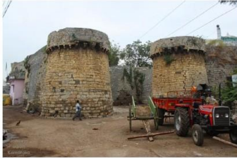
Fig. 3.7 : Malkhed Entrance No. - 1

After Chalukyas many dynasties have ruled over Badami. Among them Rashtrakutas of Malkhed were the most prominent. Malkhed originally called Manyakheta was the capital of Rashtrakuta Empire from 814 A.D to 968 A.D.