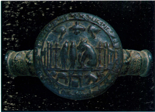
Royal emblem of Cholas