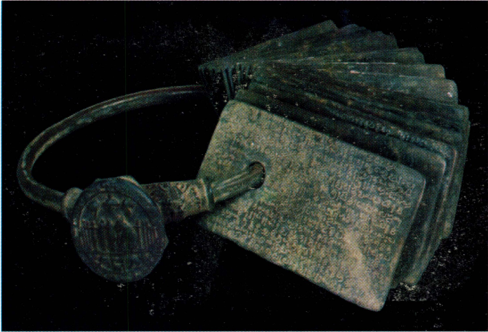
Tiruvalangadu Copper plates