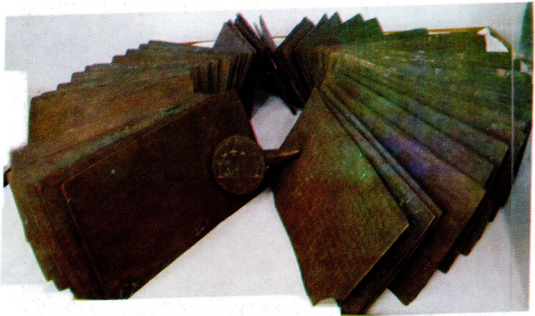
Royal emblem of Cholas