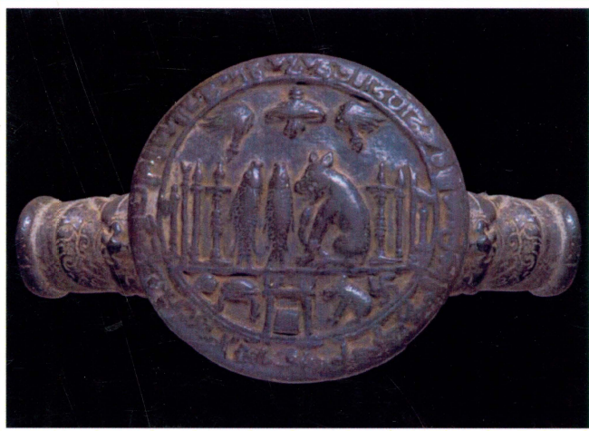
Royal emblem of Cholas