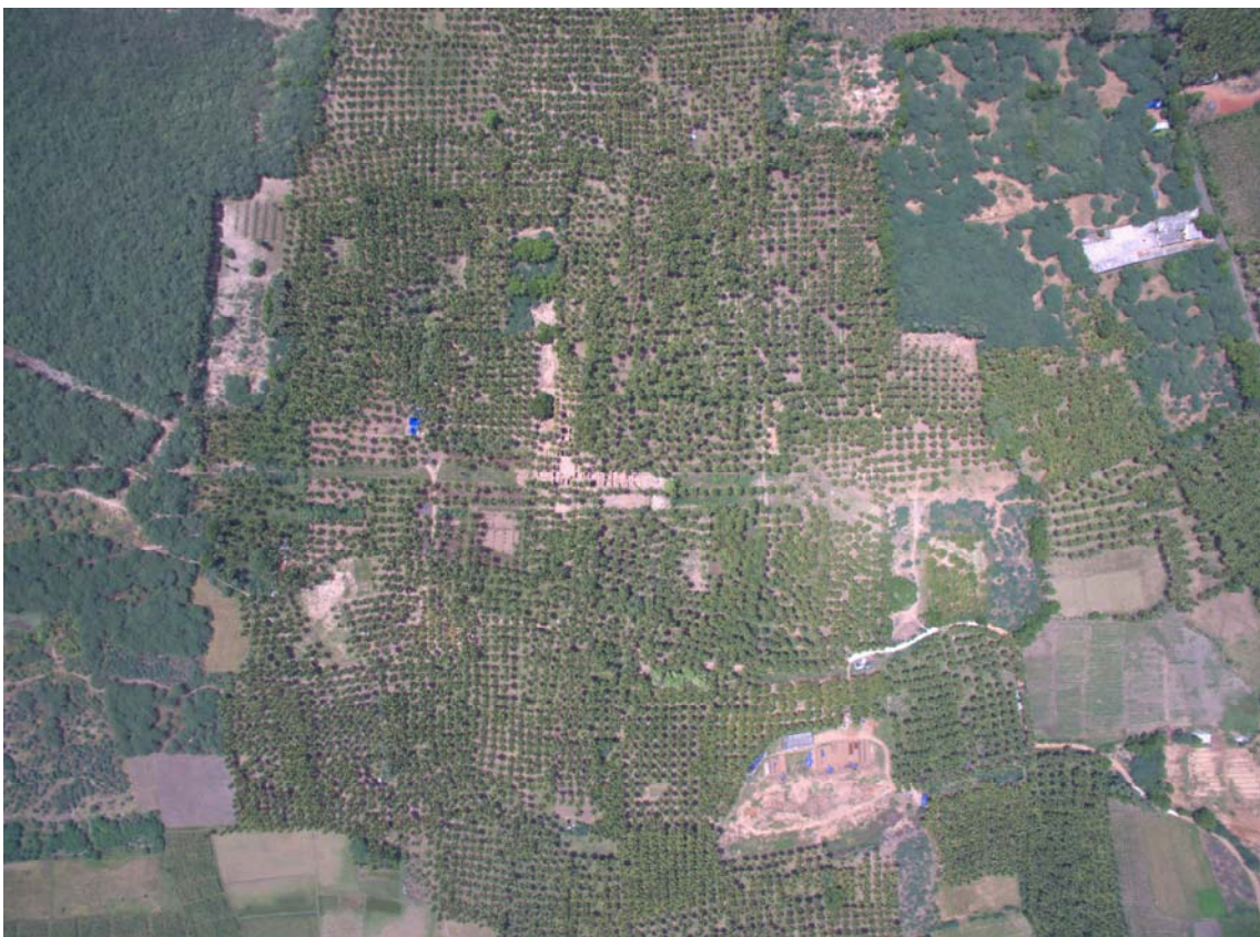
Figure 3: Aerial view of the Keeladi Mound

The impressive habitation mound spread in an area of about 110 acres with 4.5 km in circumference (Figure 3). Due to coconut grove plantation and for other agricultural activities, its topography is found to be undulated in many places. The eastern and western fringe of the mound has been more or less levelled down due to agricultural activities and brick industry while its northern and southern fringe has a gentle slope on its sides. On the east, the mound is bordered by the Manalur water tank and on the west with agricultural lands and modern village shrine. Both the north and southern part of the mound is disturbed by brick kilns and agricultural fields. On the southern side, little away from the small water tank ( Chokkatanurani ) is found a shallow depression with sand laden land strip. At the end of this land depression further on the south lie another small mound containing cultural relics similar to that of this mound.