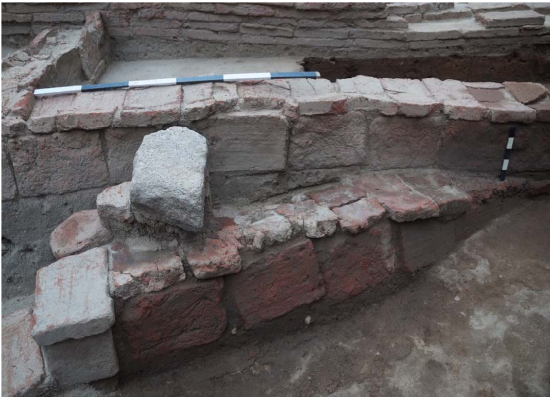
Figure 11: Close-up View of Overlapped Brick Drains

Its continuity was traced in south west orientation where it was found to split into two different channels taking turn towards south east and other going towards south. The covered top of the channel was found to be disturbed in the middle part on western side. The continuation of the channel branched towards south was completely lost. The other channel that branched towards southeast ran through the base of second tank taking a slight bend on the east and terminated with another small square shaped tank no. 3 traced on the south (YF4/4, YF5/3 baulk).