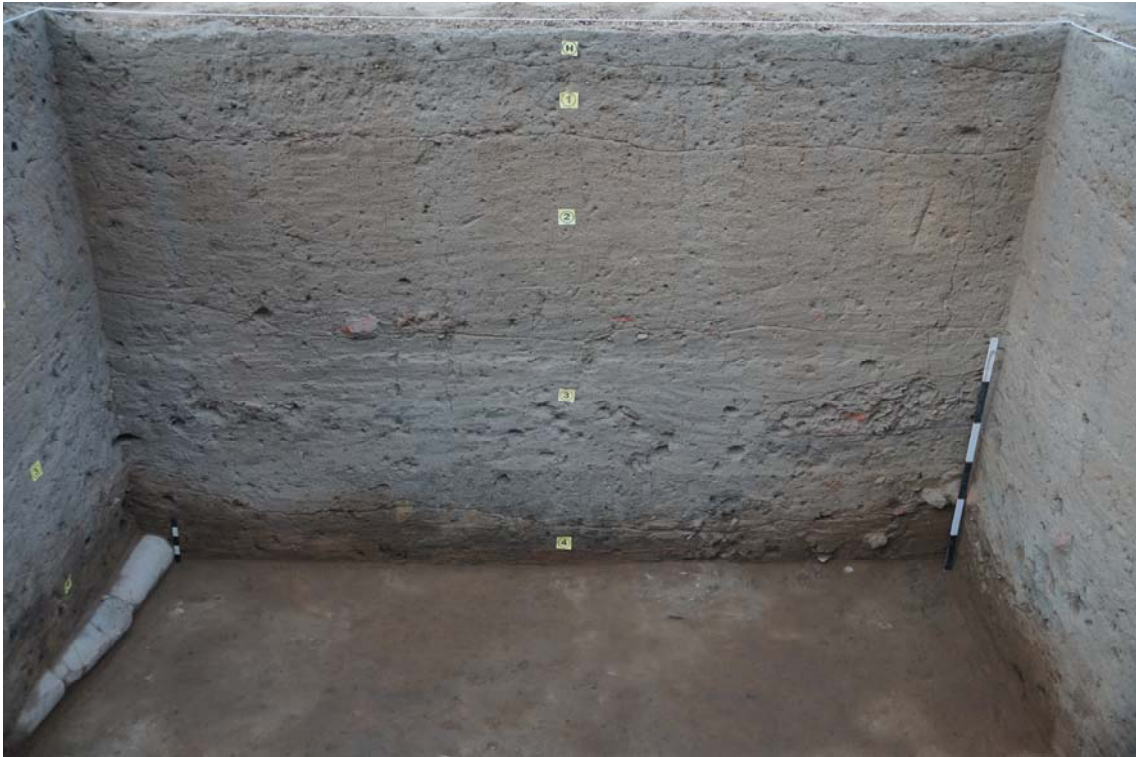
Figure 10: Exposed Terracotta Pipes

The area immediate to the west of terracotta pipes yielded more elaborate structural evidences. Two tanks like structures associated with intricate overlapping brick channels deserve mention. The first one traced within the quadrants YF4/1, YF4/4, YE4/1 comprised of a lengthy wall with paved flooring measuring about 8.70 meters. It emerged from the southern section and terminated with a square shaped brick structure.