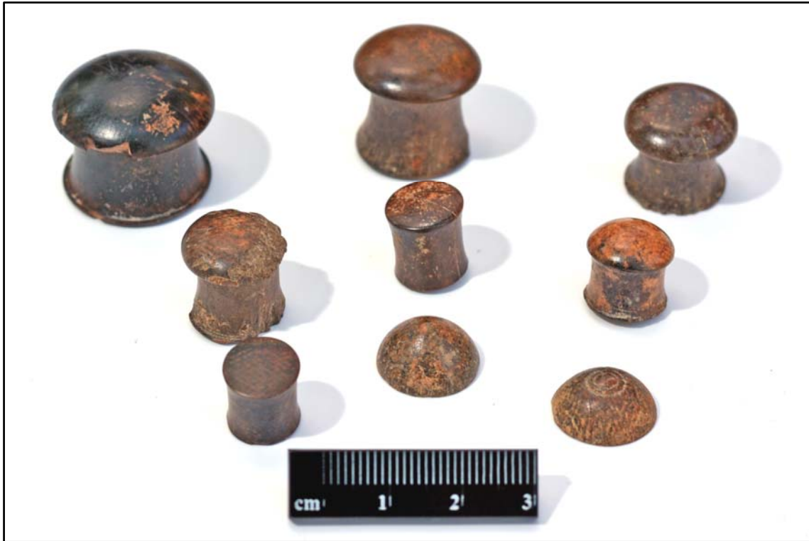
Figure 19: Ivory Objects

them were found coeval with the structural period. The antiquities can broadly be classified into the following categories.