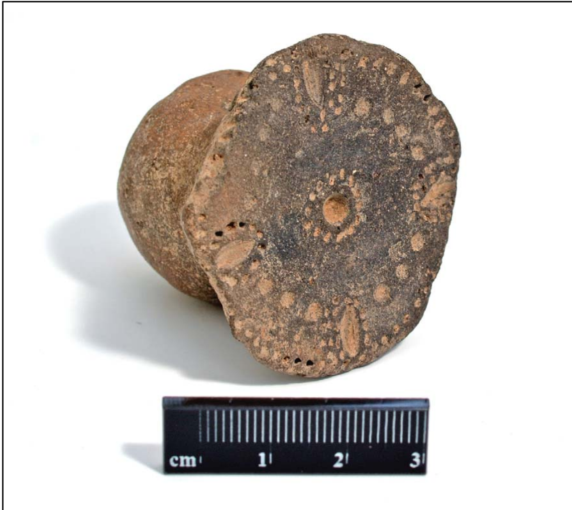
Figure 23: Terracotta Seal

the terracotta objects. It had a rounded knob with flat base containing two rows of small to medium sized concentric circles in negative impression. The center part of the seal contains a big circle bordered by small concentric circles. The cardinal points of the seal were incised with paddy clearly delineated by ribs and bordered by small concentric circles (Figure 23).