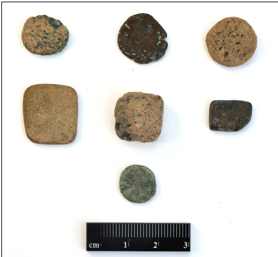
Figure 21: Copper Coins

The excavations perhaps for the first time yielded more number of ivory objects in Tamil Nadu. Despite being a deluxe item its occurrence in such numbers at Keeladi deserves attention. Most of objects found at Keeladi are finished products used in the form of ear studs, dice, combs, bead, ring etc. The occurrence of dice indicates past time activity of the elite section. The intact specimen has been numbered from one to four in the form of incised twin circles with a dot at the center. The ear studs fashioned in ivory might have been used as jewellery item. It display a hemispherical top joined by a cylindrical shaft with flat base (Figure 19). Some specimens were also found to have flat top. The occurrence of ivory combs is a rare feature in the excavations carried out in Tamil Nadu. In that context, the site of Keeladi is first of its kind to yield this evidence in stratified context. Two broken combs of varied size were collected from Locality II. The first one seems to be curved variety while the other resembles a thin pocket comb. The either side of the comb were decorated with small concentric circles in regular intervals (Figure 20).