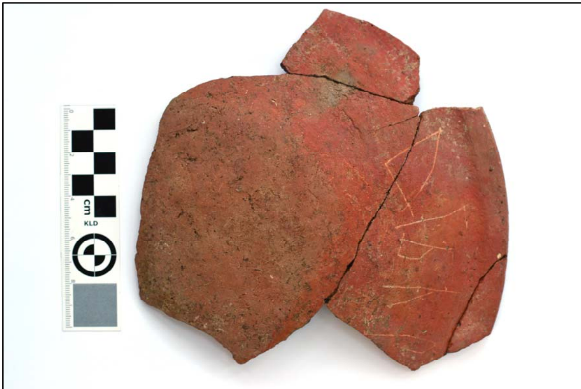
Figure 16: Tamil – Brahmi Inscribed Potsherd ' eravathan '

Graffiti sherds: The post firing ligatured graffiti accounts for about six hundred sherds from both Locality I and II from different levels. The scratching was mostly on the exterior of the pot with few examples made inside it. Among the pottery repertoire red ware, black and red ware and russet coated ware contained the maximum number of graffiti. As far as the various patterns are concerned, the arrow was the most common symbol found to occur either in single or in composite forms. Besides this, the other forms found in the potsherds include ladder, fish, spirals, swastika, trident, sun, cart, leaf, wavy lines, single or double 'U' symbol, brahmi 'ma' like symbol with or without enclosure etc.