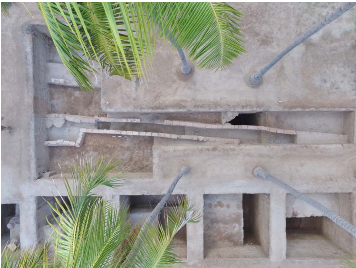
Figure 7: Aerial View of Exposed Brick Channel in Locality – II

The rectangular brick structure was furnished with proper brick flooring on all sides. The brick of the flooring was set over the rammed foundation soil with its header set in east west orientation (i.e. horizontal manner). Every brick has been precisely fitted and bounded together with mud mortar at the flooring level. The flooring also yielded good number of grooved roof tiles again suggesting a roofed super structure made of perishable material.