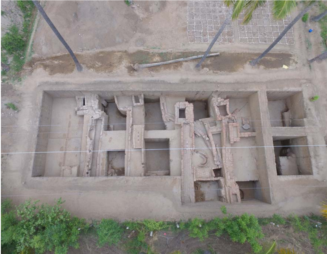
Figure 9: Aerial View of exposed Brick Structures in Locality – II

at a depth of 2.25 meters (YF4/2, 3). The northern end of the pipe was found to be slightly broken but certainly joined with the hemispherical red ware pot kept at the mouth level. The opening of the pipes on the other end also seem to have been fitted or joined with multiple big storage pots kept one above the other. Three such red ware pots in broken condition were exposed at the southern end of the pipes. A broken big globular pot was also seen placed near the pots at a little higher level. The total length of the pipes leaving the pots on either end measured 3.55 meters. The length of each pipe varied from 0.55 – 0.70 meters.