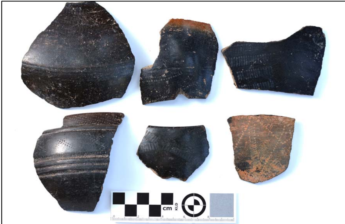
Figure 13: White Painted Black and Red Ware Sherds

Red slipped ware: The red slipped ware formed was found in limited quantity and majority of them came from the upper levels. With fine to medium fabric, some of the storage vessels had decoration on its exterior. The shapes in this ware included medium sized storage vessels, pots etc. Locality I yielded some rare specimens of this ware in the form of lustrous globular pot with spouts on the exterior. These pots are rarely seen and definitely brought to the site from elsewhere.