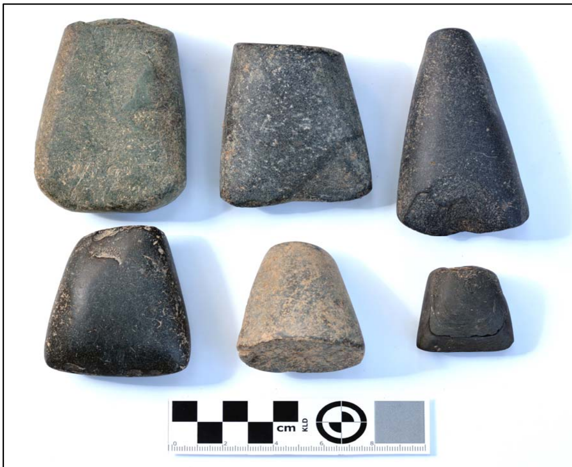
Figure 25: Stone Celts