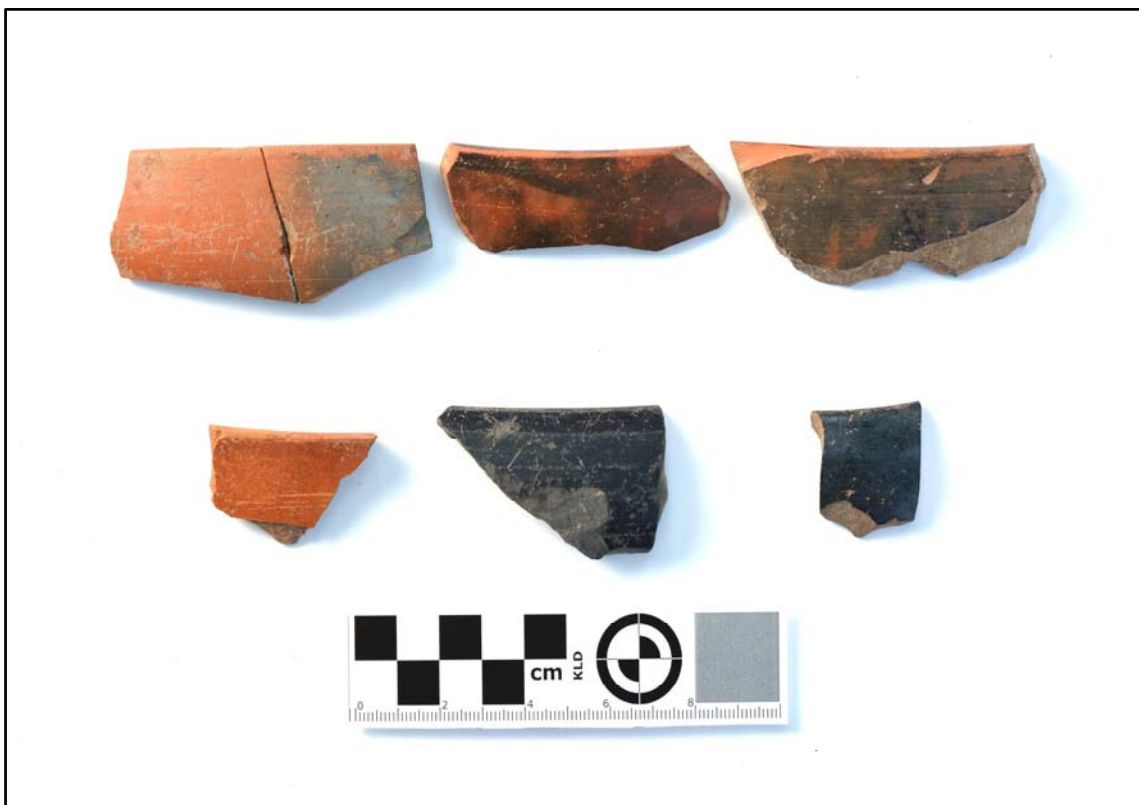
Figure 15: Sherds of Rouletted Ware