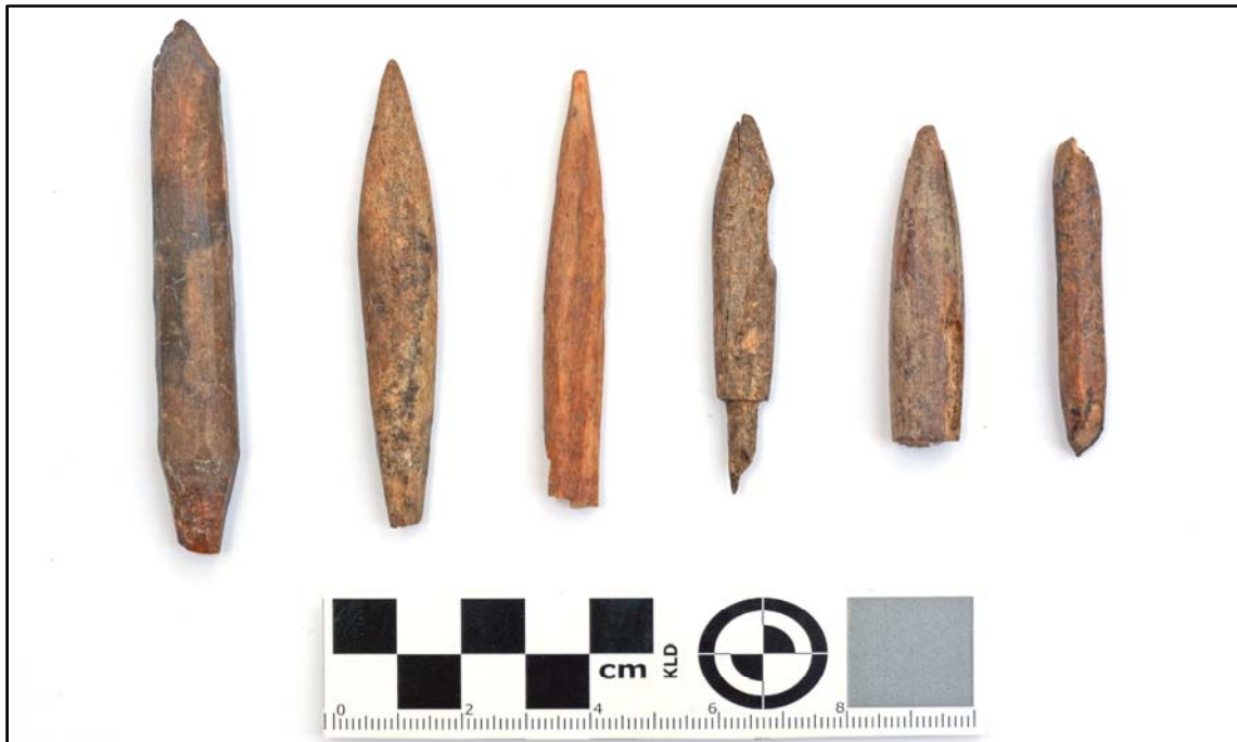
Figure 24: Bone Points