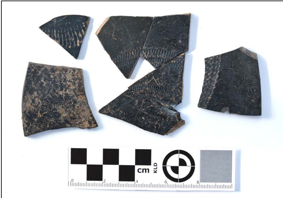
Figure 14: Sherds of Rouletted Ware