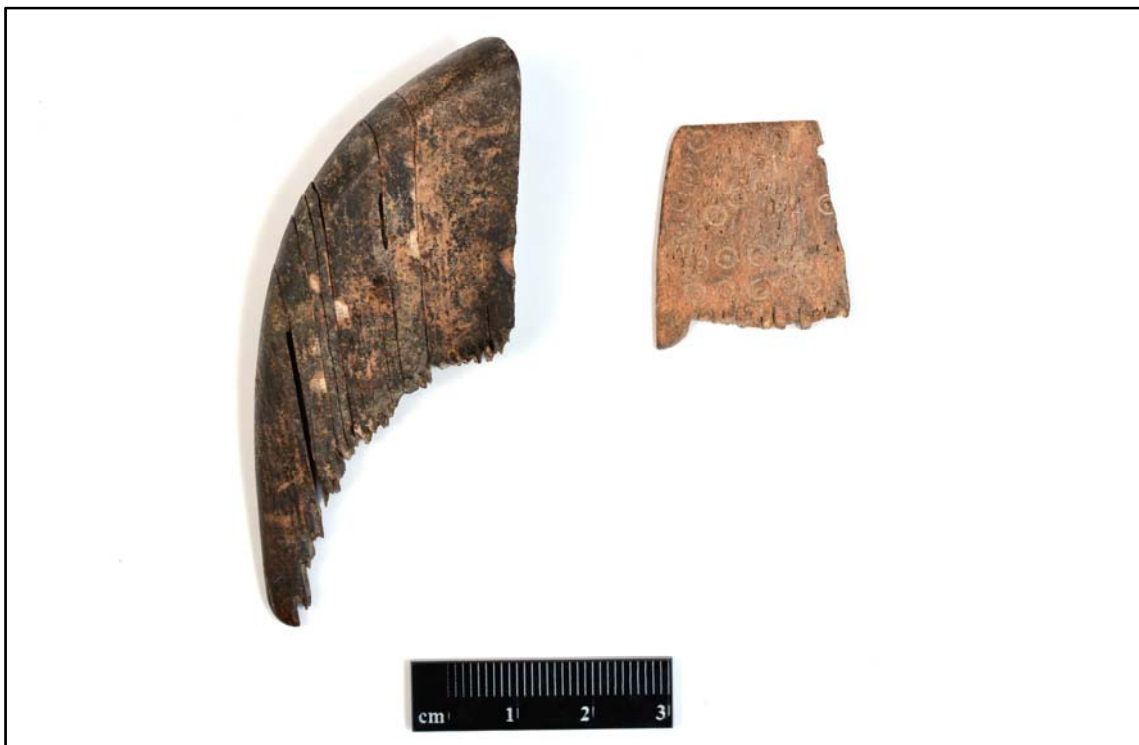
Figure 20: Ivory Objects