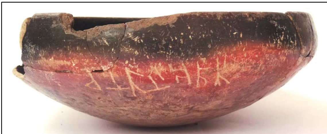
Figure 17: Tamil – Brahmi Inscribed Black and Red Ware Dish ' ce n ta n a va (ta) thi '