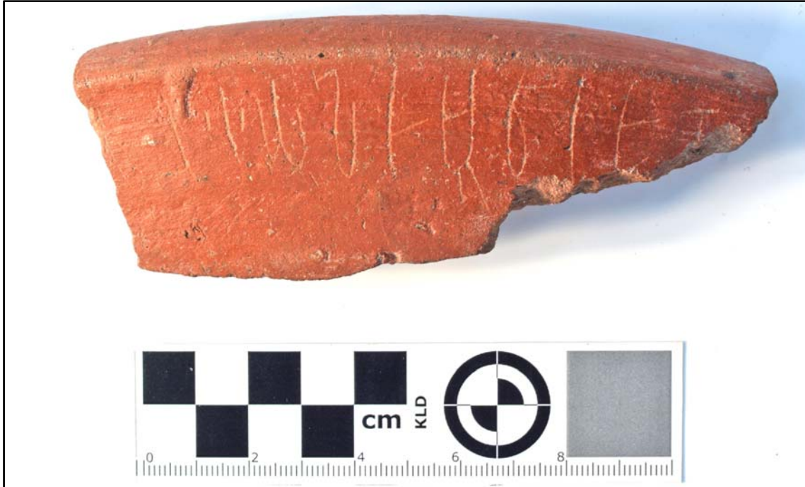
Figure 18: Tamil – Brahmi Inscribed Potsherd ‘ va se i y pe ru mu va r u n..... ’

Tamil - Brahmi inscribed sherds: About 70 Tamil-Brahmi inscribed pot sherds were collected from two field seasons. All the inscribed sherds came from Locality II coeval with the structural activities of Layer 2. The red ware and black red ware ceramic variety was more preferred for writing purpose. The nature of these writing on the pottery was primarily aimed to register names of individuals probably its owner’s. The inscribed sherds revealed an array of pure tamil, pure prakrit and prakrit converted to tamil language having names of individuals such as ‘athan’, ‘tisan’, ‘uthiran’, ‘iyana’ ‘surama’, ‘sathan’, ‘eravathan’ (Figure16), ‘santhan’, ‘madaicime’ ‘santhan avathi’ (Figure 17), vendhan, muyan, sampan, perayan, ..kuviran kuravan, vasai perumuvar un... (Figure 18) etc. Few pot sherds inscribed in prakrit language namely ‘rajakatasa(?)’ ‘guthasa’, could be of Srilankan origin. Interestingly, the evidence from one of the lead coin bearing the legend ‘guthasa’ reported from the site of Akurugoda (Tissamaharama), Sri Lanka on its reverse corroborates this fact (Boperarachchi and Wickremesinhe 1999: 57). The size and mode of writing differ due to pot surface and style of writing by the individual. Some of the names have parallels with that of the names found in the Jain caverns around Madurai region and other excavated sites in Tamil Nadu. On the basis of stratigraphy and palaeographical grounds, these inscribed sherds may be dated to c. 2 nd cent BCE - c. 1 st cent CE.