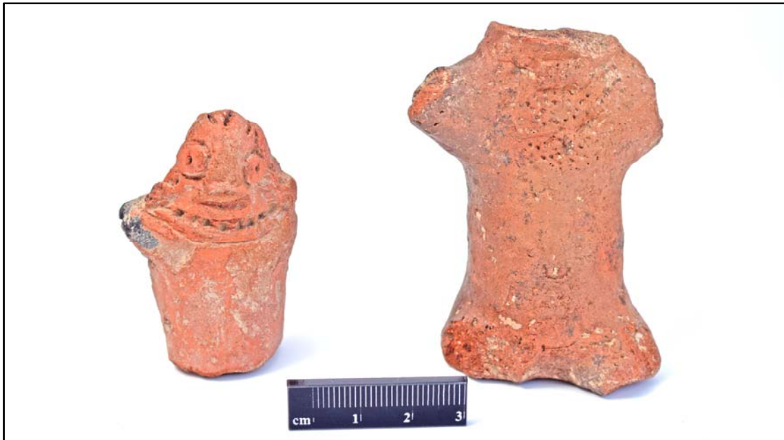
Figure 22: Terracotta Figurines

The excavations yielded a total number of seven copper coins (square and round) in proper stratigraphical context. Most of them are highly corroded and require chemical cleaning to trace any legend on it (Figure 21).