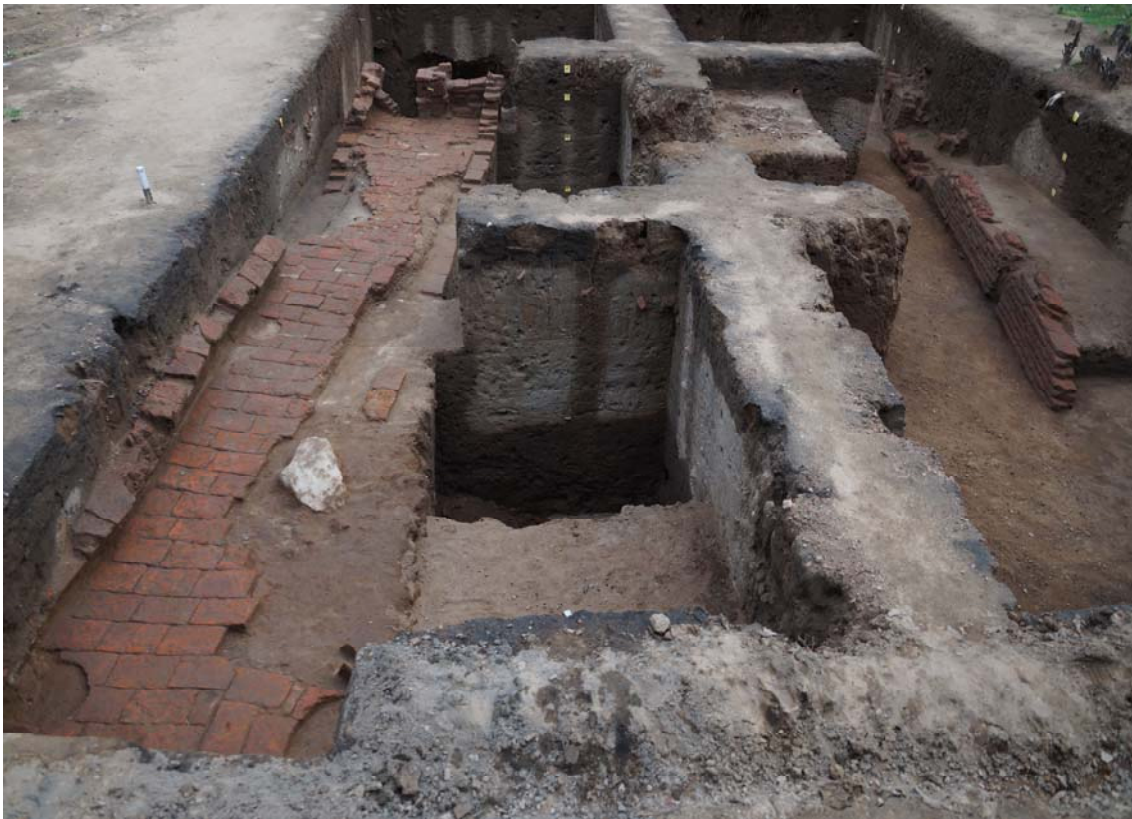
Figure 6: Remains of Brick Flooring and Walls in Locality – II

At Locality II (Extn) three major structures were exposed one after another leaving some interval in between them. The first structure exposed during the season (2014 – 15) was the lengthy brick floor with remains of side walls on either side. Originating from southern side (YE1/3) this structure (Figure 6) extended towards north to a length of about 10.50 meters (YE1/2,3 and YF1/3). The occurrence of numerous broken grooved roof tiles suggests it had some sort of super structure supported with wooden rafters. Irregular shaped post holes were also noticed within the flooring at intervals. At a little distance away from the western side wall was noticed terracotta ring well coeval with the flooring. The well contained about twenty one courses of rings with the lowermost rings set within the river sand below the natural soil.