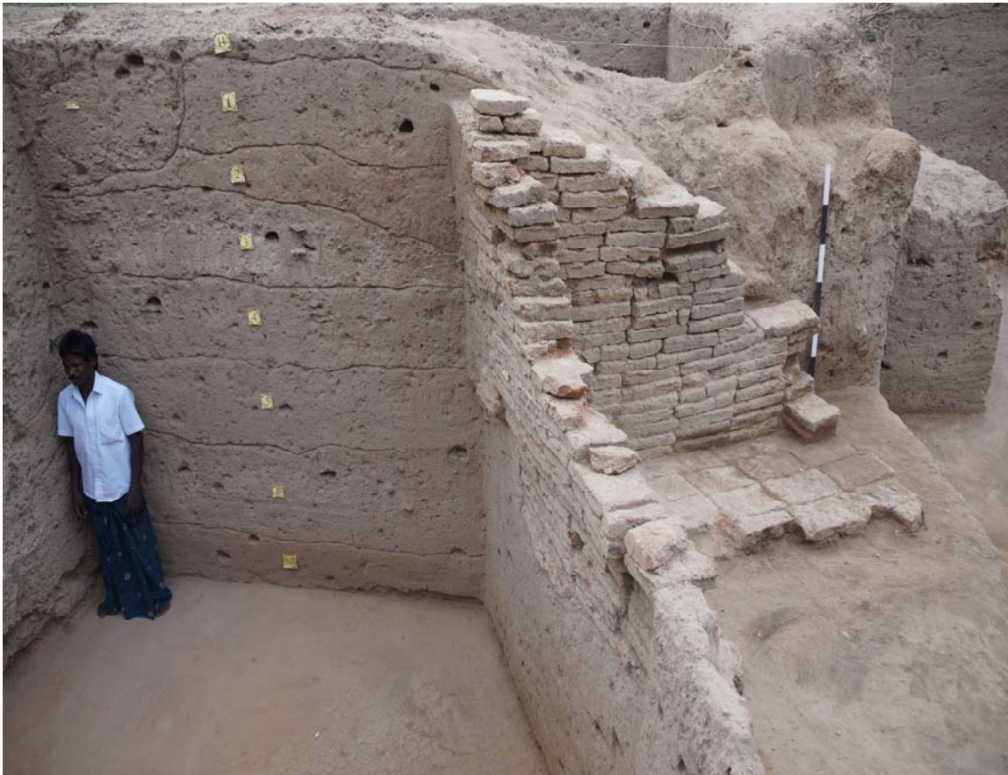
Figure 5: Stratification of Layers in Locality - I

This part of the mound designated as Locality I was selected for excavation during first season (2013 – 14) to understand the nature of the exposed structure and possibility of any other associated remains in the surrounding area. Cuttings revealed that this structure (A1/3) survived with western and northern walls only. The southern and eastern wall of the structure was already lost due to removal of earth. It seems that the surviving walls originally formed part of a square shaped structure with paved brick flooring (Figure 5).