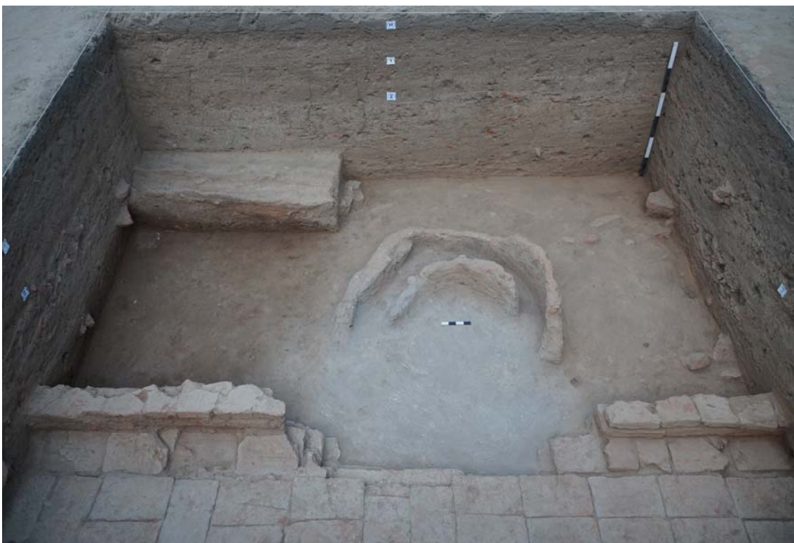
Figure 12: Double Walled Furnace with Ash Deposit

On the basis of depth and contextual position, the small square shaped brick tank probably represents the earliest structural activity in this area. Its relation with different level of covered brick channels and terracotta pipes indicate its importance used to process material continuously for a longer period of time. At a later stage the paved wall of Tank no. 1 was constructed over the eastern wall of the Tank no. 3. Stratigraphically this tank was sealed by layer 3 with its foundation resting on layer 4.