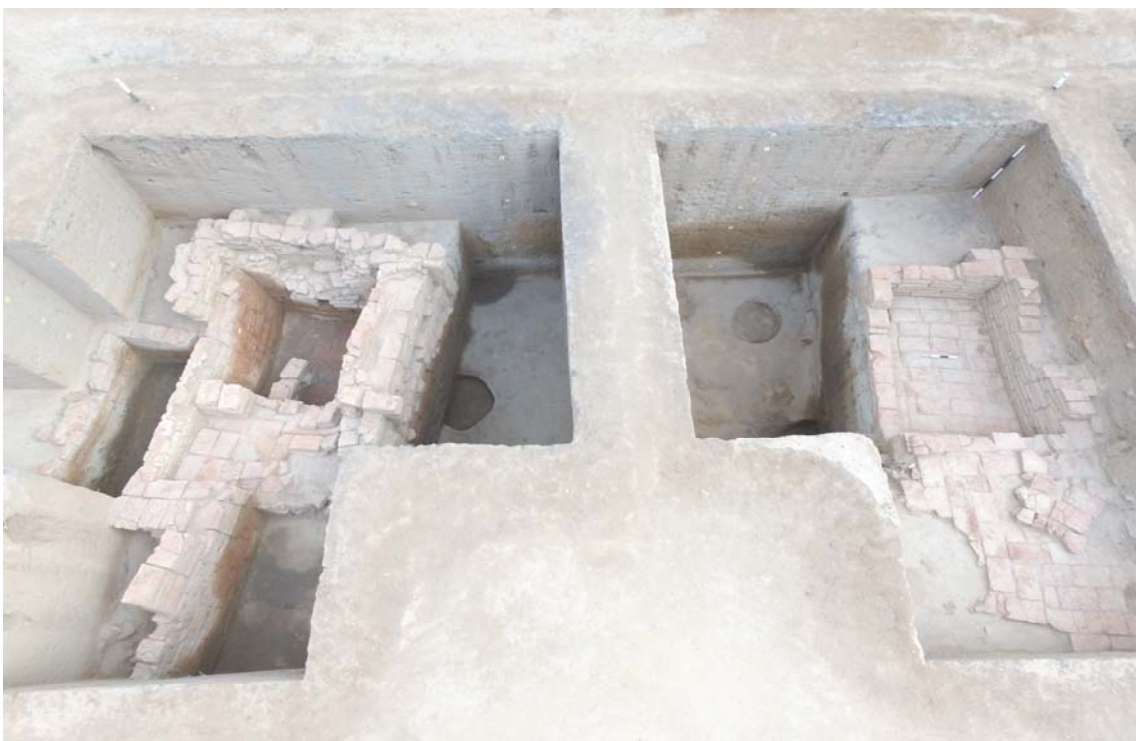
Figure 8: Aerial View of Exposed brick Structures in Locality – II

On the eastern side (ZF2/4) at a gap of about 1.70 meters of the structure found on ZF1/3 was exposed another fragmentary parallel running wall in north-south orientation. Both the walls were damaged extensively due to pit activities but traces of pebble flooring could be seen both inside and outside the walls. The occurrence of above structural evidences indicated the area on the western side of the mound might contain more contemporaneous structural evidences of a much larger complex. Accordingly on the western side the quadrants YE1/1and4, YF1/4, YF1/1 and YF2/2 were tackled.