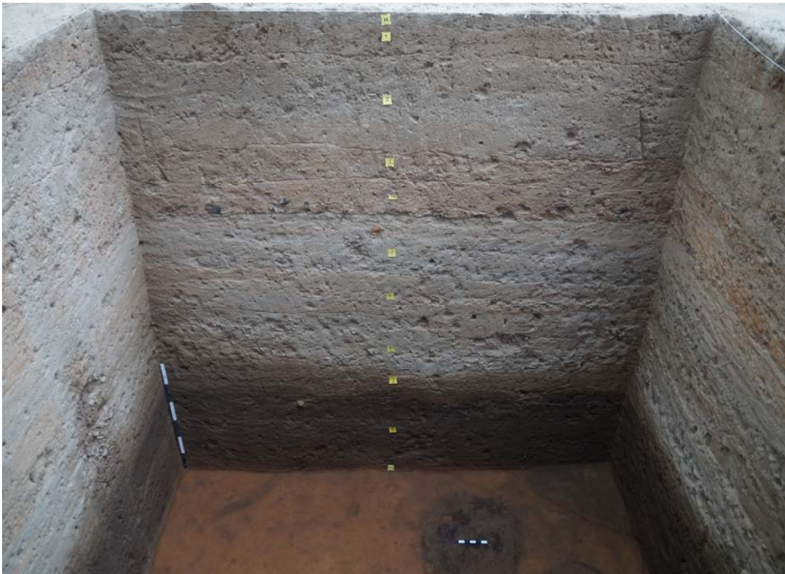
Figure 4: Stratification of Layers in Locality – II

The stratigraphical position in all quadrants of YC1 found to be similar in nature. This trench had a cultural deposit of 4.00 meters from the present ground level (Figure 4). The humus measured about 0.16 meters in thickness, loose in composition and grey in colour.